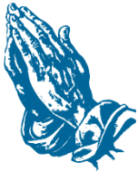
Talking to God

Our faith isn't just for Sundays; it's meant to shape our whole lives! Here are 7 ways to live out your faith every day: